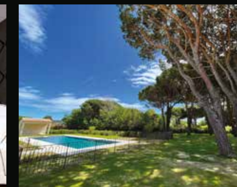
Villa with Pool